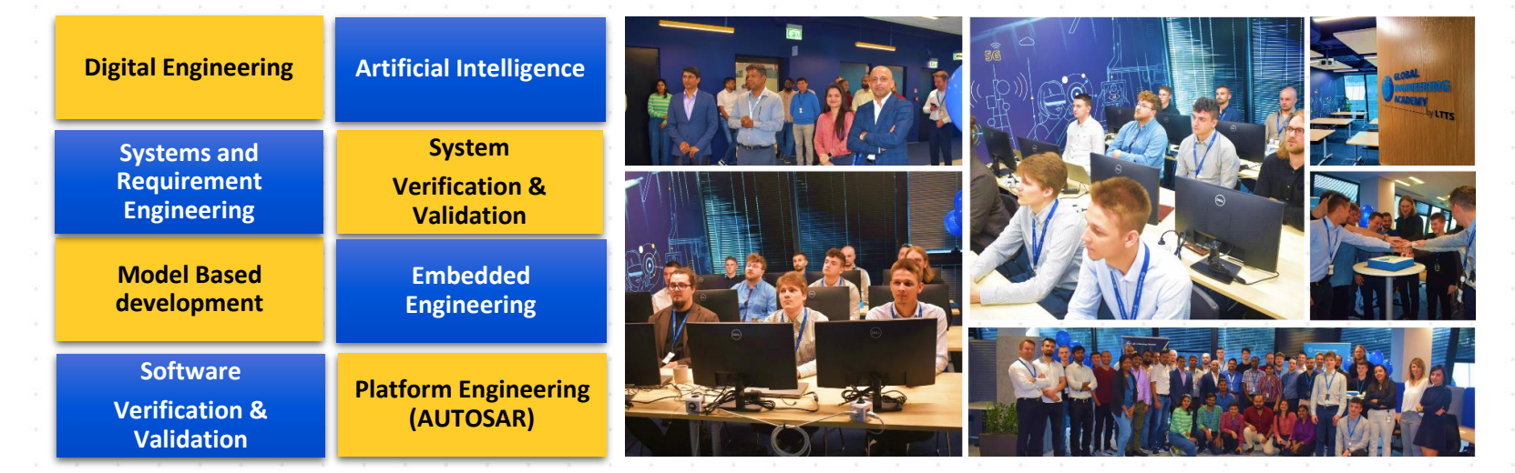
Multiple Domains, technical skills, experience level supported by our Global Engineering Academy